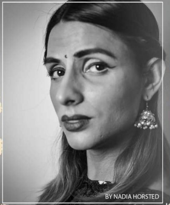
BY NADIA HORSTED