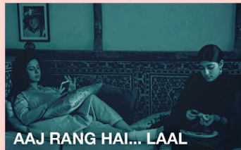
AAJ RANG HAI... LAAL